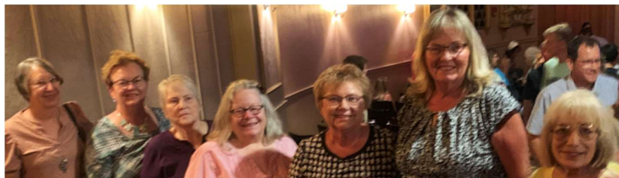
Members at Des Moines Register's Storytellers