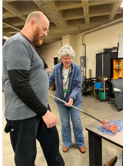
Ginger helping out at JJ Gaffer