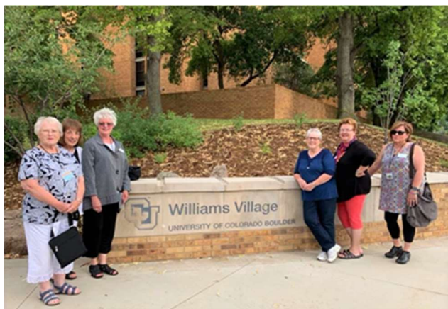
The crew from Des Moines arrive at Williams Village