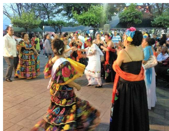
Parque de La Marimba

The history of the indigenous cultures is one of the biggest draws. If you want to learn more about the Mexican people, their economy, their ancient history, Mayans, Aztecs and Olmecs, this most southern state of Mexico is where you want to travel.