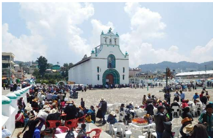
Church at San Juan Chamula, a mayan village in Chiapas. The town was the staging ground of the Zapatista rebels in the 1990s.

The history of the indigenous cultures is one of the biggest draws. If you want to learn more about the Mexican people, their economy, their ancient history, Mayans, Aztecs and Olmecs, this most southern state of Mexico is where you want to travel.