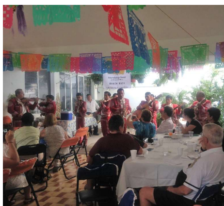
Mariachi Band at Farewell Party

Tuxtla Guterrez, in the state of Chiapas, is an easy destination to get to. Definitely not the tourist mecca -- a young, noisy, cluttered, industrial city whose planners are just thinking about developing expansion guidelines for the city. If you drive in the city you will find streets of dirt, gravel, cobblestone, and pavement; when traveling in city buses can be challenging, many take vans. The closest hotel from the airport is about 30 minutes away...your best friend will be a handheld fan. Like any city, it has its parks, museums, and other entertainment venues but on a much smaller scale. There didn't seem to be a real "tourist" area so you were in the "real" part of town all the time.