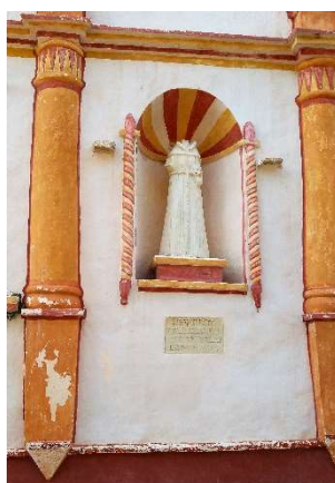
Headless saints at Iglesia San Sebastian, Comitan