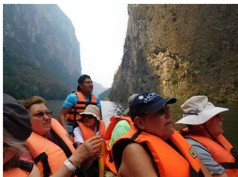
The Grijalva River and Sumidero Canyon

Oh, yes, and then there are the Tamales...a staple of Chiapas that come in as many varieties as you can imagine. Served for breakfast, lunch, and dinner in simple presentation to formal. Elote (corn) was my favorite. Fresh fruit such as mangos, bananas, and pineapples are readily available at every meal. I had a great cuisine experience - not always knowing what I was eating but enjoying it all. Eating fresh cut pineapple chunks from a roadside vendor while driving in the hot humid countryside was one of the best experiences. We drank bottled water but ate the fresh fruit without incident. Mexican food is generally not prepared hot to the taste – but the sauces they add can cause the heat.