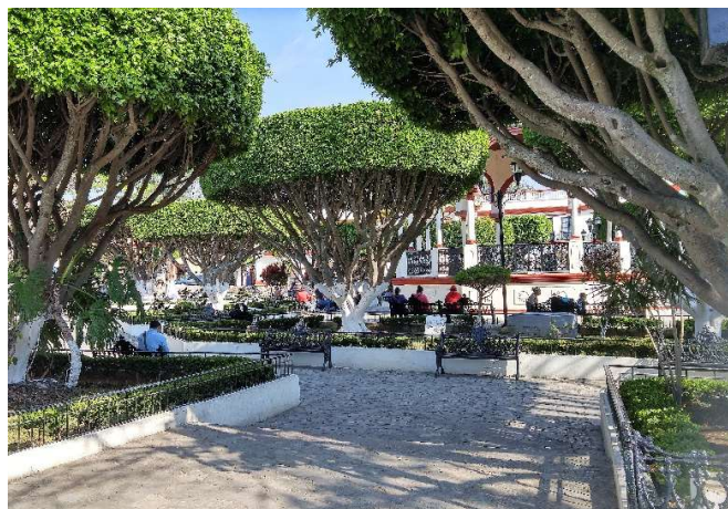
Beautiful Comitan de Dominguez town center with its flat top trees and bougainvillea.