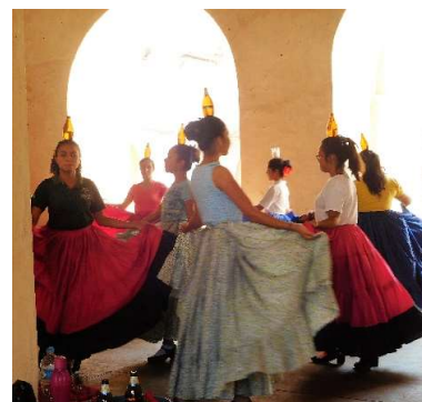
Dance students at Santo Domingo de Guzmán in Chiapa de Corzo