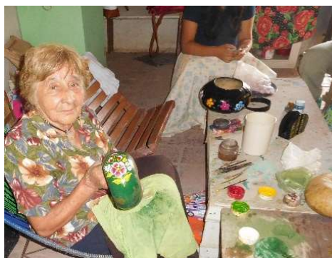
Artist in Chiapa de Corzo