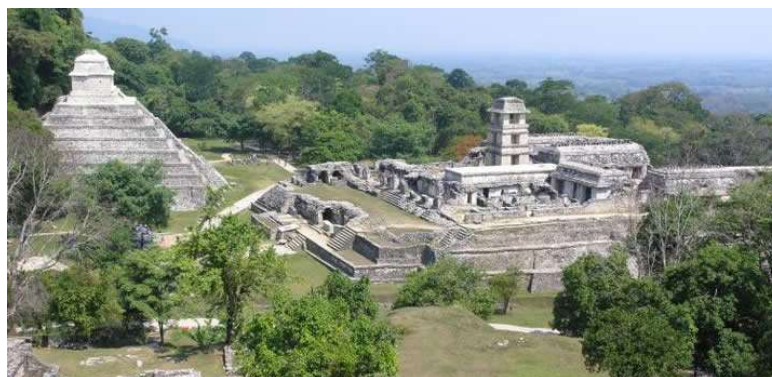
Palenque Ruins, UNESCO Heritage site