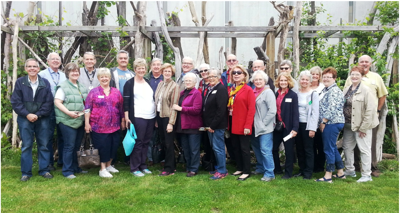
Touring World Food Prize Hall of Laureates