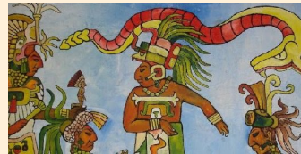
FF Mundo Maya April 2017 outbound