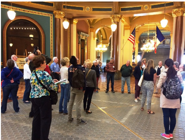
Touring World Food Prize Hall of Laureates