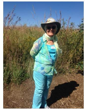
Looking for bison