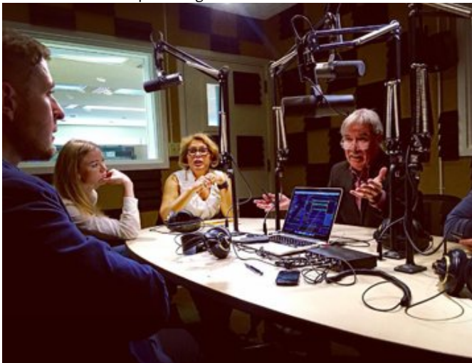
Working with radio professionals