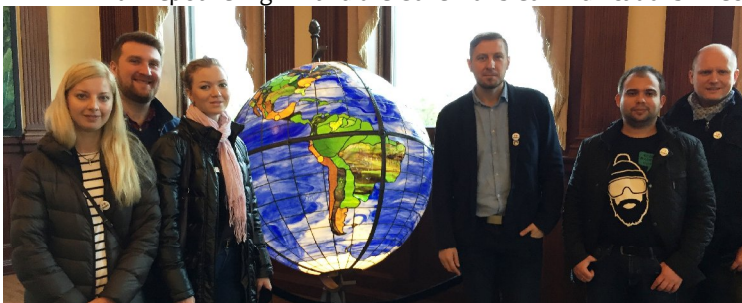
World Food Prize Hall of Laureates