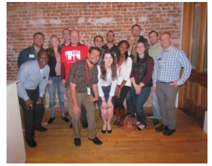
With DM Young Professionals