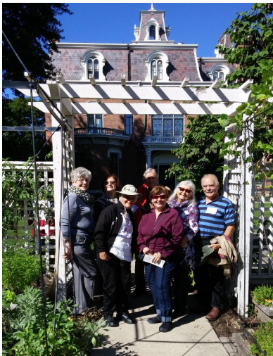
Terrace Hill Garden