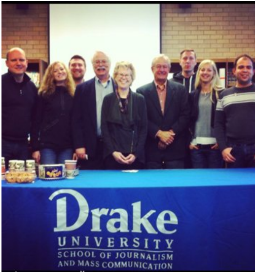
Drake University School of Journalism