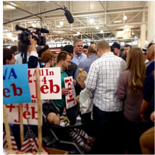
Meeting Jeb Bush and the media crush